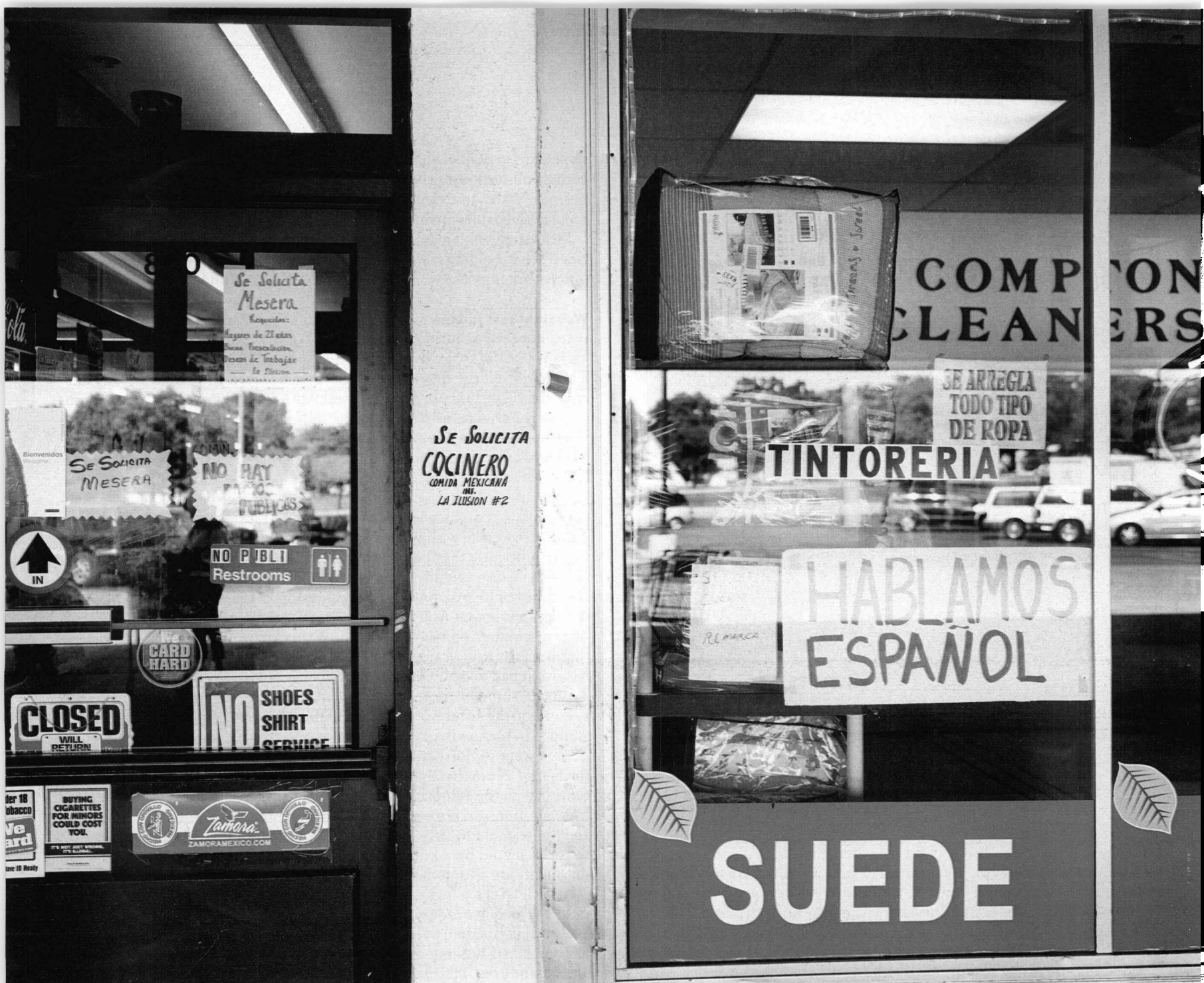
Language Barrier A storefront in a strip mall on the east side of Carpentersville reflects the town's changing population, which is now estimated to be 40 percent Hispanic. Opposite: Another side of Carpentersville.

a slate calling itself the All American Team won seats on the