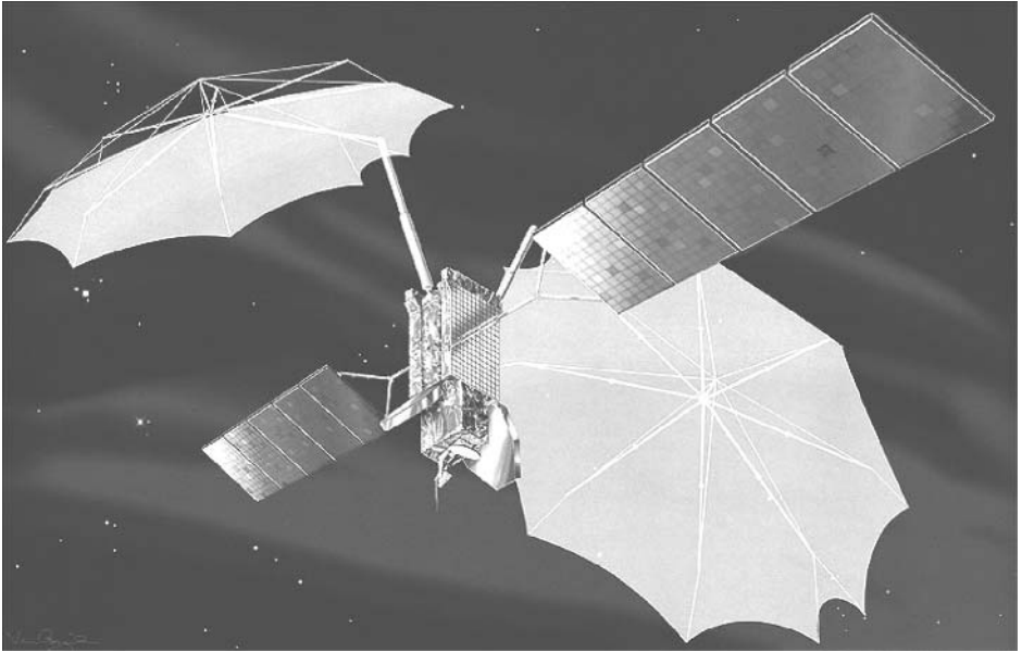
Figure 10.11 Rigid panel GaAs solar array (Picture courtesy of NASA). (The PV array is the two rectangular panels of five modules each)