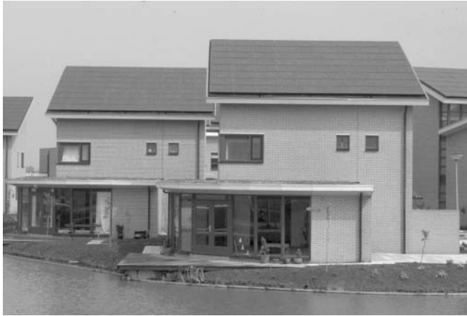
Figure 22.34 Alutec profile system in a new roof in Langedijk HAL (NL). Capacity of the system is 53 kWp and the project is part of the 5 MW BIPV project. Reproduced with permission by BEAR Architecten M. van Kerckhoven