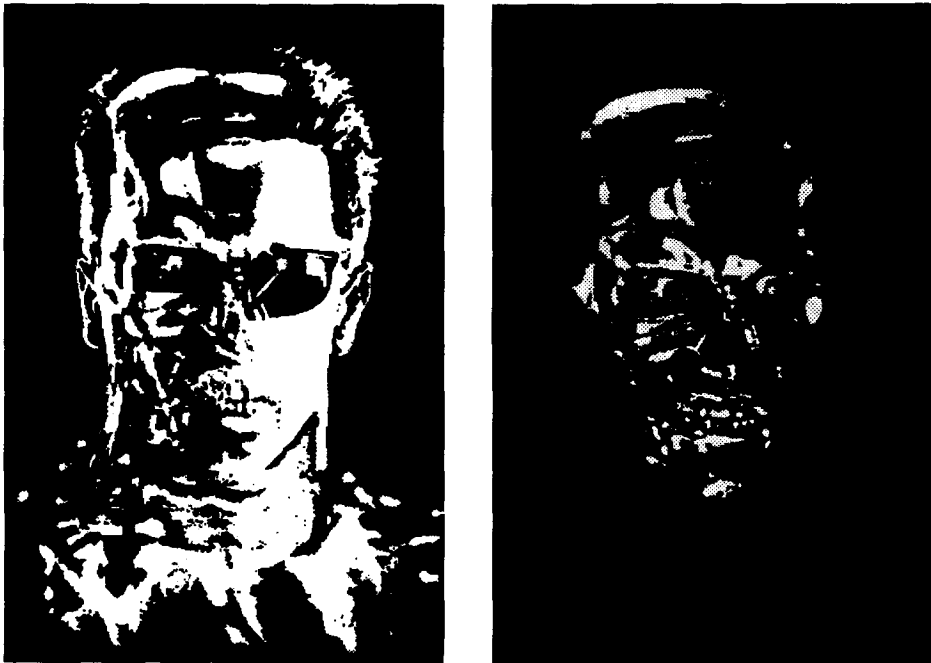
Fig. 3. Two images photocopied from the same hologram. Holograms, with their various features, represent a fundamental way in which to demonstrate aspects of Pribram's (1991) holonomic brain theory which models (both conceptually and mathematically) perceptual and cognitive processing going on in the brain. The many regimes of information processing that are embeddable in holograms (as portrayed in two regimes in these images of Arnold Schwarzenegger) illustrate in a simple way how the many experiences of body and mind (mental models) might occupy the same space–time, spectral dynamical field.

Inside the skull, “body” is projected to seem to be “out there” (left image, Fig. 3); while the mental models of mind are projected to seem to originate and seem to be “in there” (right image). It is my view that the projective separation of body and mind is a new macro level self-referential copy of the original figure–ground separation of the dynamical body from its dynamical surround described earlier. The survival value of the mind–body separation is as great as the original environment–body separation upon which it is erected. For example, confusion in the overall brain system between consciousness itself and hypothetical mental models of consciousness would be disastrous! For cave dwellers living 40,000 years ago confusion between themselves and their cave paintings (mental models) would equally not make sense.