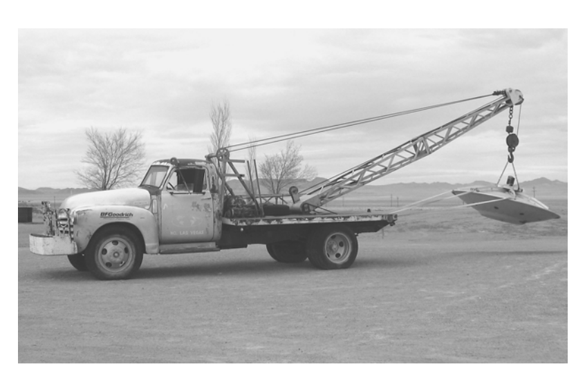
2. Outside the Little A'Le'Inn, Rachel, Nevada