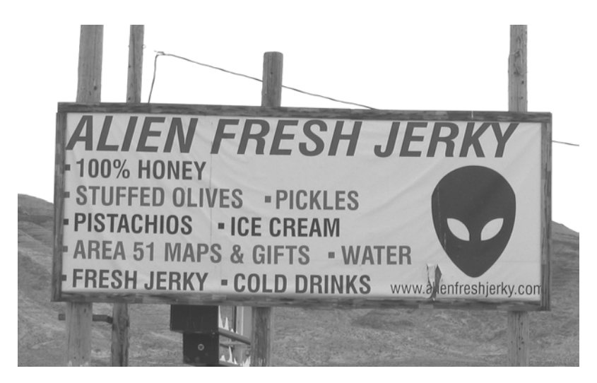
5. A billboard near Area 51

question. Rachel was still set up to appeal to the few saucer seekers who dared to brave the desert, however. One billboard outside town advertised 'Alien Fresh Jerky,' whatever that is. The road running by Groom Lake and Rachel was marked by official signage from the State of Nevada naming it 'The Extraterrestrial Highway.' In Rachel proper, an old and weathered plywood sign showed an alien leaping over a candlestick – an ad for a gift-and-candle shop. The local gas station had a sign depicting flying saucers with the word 'Gas' written in big red letters high atop a utility pole. An old wrecker truck hoisting a crashed saucer in the air was parked out front of the Little A'Le'Inn, weaving together the Roswell crash story and the Area 51 mythology in one iconic image. Inside the establishment I found pretty much what I expected, friendly bar service, tables for enjoying the restaurant's short orders, and lots and lots of UFO collectibles, most of which seemed almost identical to the souvenirs for sale at Roswell.