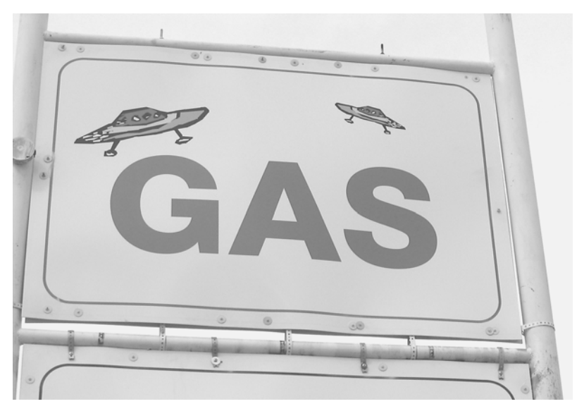
6. Saucer refueling station in Rachel, Nevada. No indication of the price of saucer fuel

lights in the sky or to have handled the wreckage from a downed flying saucer. They were part of what was derisively called the 'lunatic fringe' by those in the 'nuts and bolts' UFO communities, and they claimed not only to have seen extraterrestrials and their crafts but to have had contact with such beings and taken rides in their flying saucers. They came away from these contacts with messages for mankind, at least in one case about the need for changes in the human diet, but most of the time with messages of world peace, human brotherhood, and the need for love and kindness. These were the contactees.