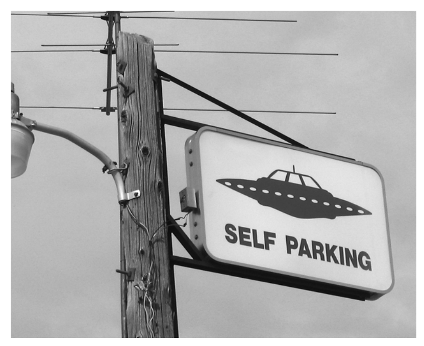
1. Saucer parking in Rachel, Nevada near Area 51

crescent-shaped objects moving at great speed. The objects were flat and highly reflective. Arnold described their movement as reminiscent of a saucer skipping across the surface of water. The term 'flying saucer' thus entered the English lexicon, though not at that point with clear extraterrestrial connotations. As a matter of fact, Arnold would later say that he had originally assumed that his sighting had been of terrestrial guided missiles.