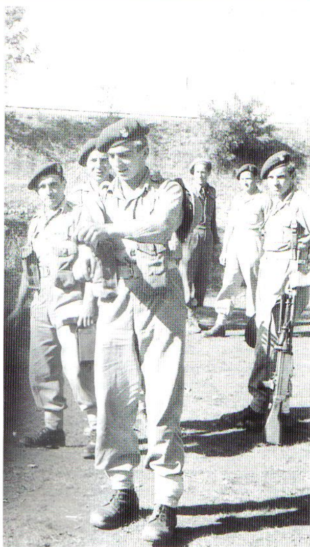
Troops of Polish 2nd Motorised Commando Battalion in khaki drill field uniform and green