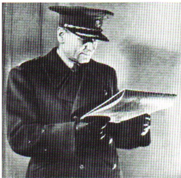
Lt. Gen. Ingr in the Czechoslovak general officer's service uniform

These emigré servicemen, fanatically anti-German and with priceless ‘in-country’ knowledge, were valuable recruits for unconventional and clandestine warfare being developed by the British. Some joined 10th (Inter-Allied) Commando, a unique international unit, formed 2 July 1942 with 10 companies (‘Troops’)—including the mysterious