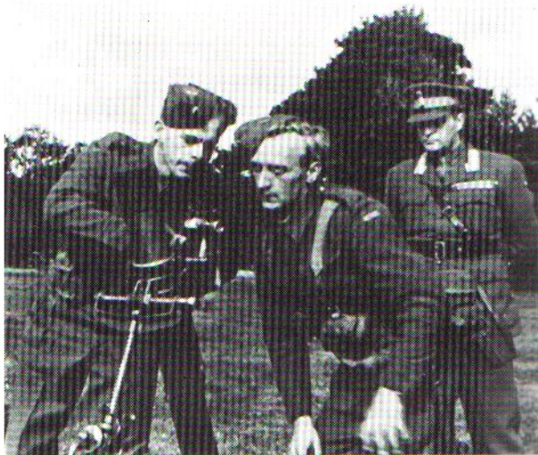
Crown Prince Olaf of Norway, far right, in the khaki service dress of a general (a rank reserved for the royal family),