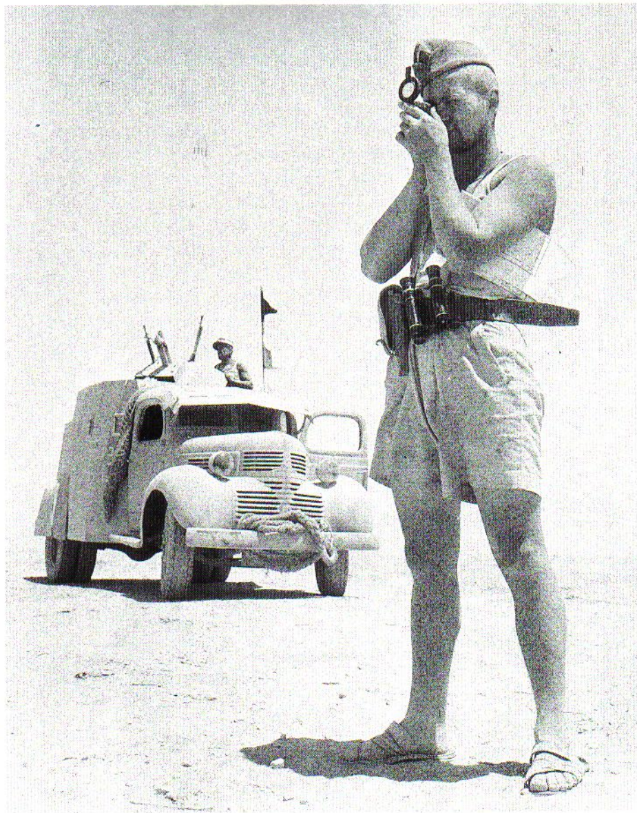
Spahi junior officer or adjutant in North Africa, 1942: note red sidecap with braid chevron ranking on front of the crown.

laborators; and so were 'exiled' to Libya, where Force L became 2°DFL, and on 24 August 2nd Armoured Division (2DB). A new French Army was constituted on 4 August 1943, and the terms 'Free French' and 'Fighting French' were officially abolished. The Army had eight infantry divisions: 1 motorised (1°DMI, but always known as 1°DFL); 1 Moroccan (2DIM); 1 Moroccan Mountain (4DMM); 3 Algerian (3, 7, 8DIA); 2 Colonial (9, 10DIC); and 4 armoured divisions (1, 2, 3, 5DB) plus 4 regimental-strength Groups of Moroccan Tabors (1-4GTM). 6 Commando battalions were formed, and on 5 January 1945 were redesignated