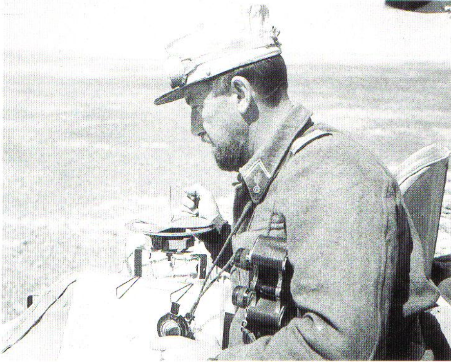
13DBLE officer, 1942: pale khaki-covered kepi; British BD; dark blue collar patch with two gold braids, gold grenade with '13' in bomb; gold-on-dark-blue rank loops on shoulder straps.

red, as the divisional arm badge, although the Cross had been worn unofficially by some units since 1941 on a blue shield. The Transition Army wore pre-1940 French, from November 1942 some British uniforms, the French Army from August 1943 mostly United States uniforms.