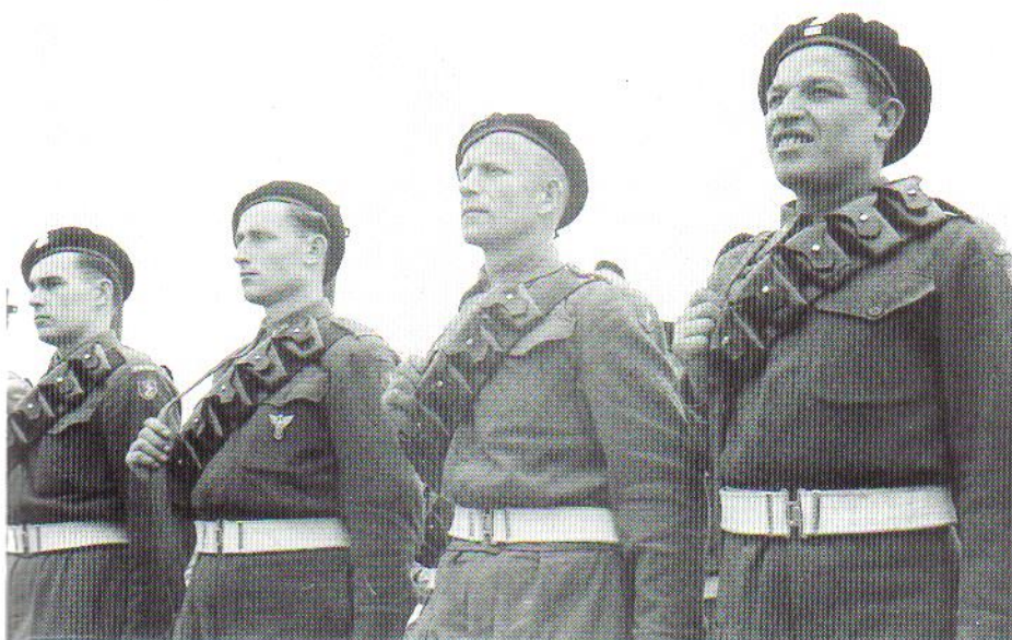
Cavalrymen of the 12th Polish Lancers Armoured Regiment on parade, with black berets, cavalry bandoliers and, as 2nd Corps HQ troops, the red Corps badge, 1944