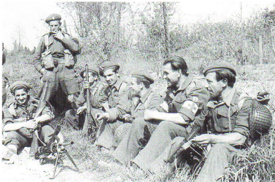
Polish infantry from the 3rd Carpathian Infantry Division resting near Bologna, central Italy, in April 1945. Note the khaki general service caps; and the divisional patch above the red cross brassard.

strong Polish Air Force in France with four fighter squadrons (I–IV/145), but only I/145 saw action. From July 1940 Maj. Gen. Ujejski, from 1 September 1943 Col., later Maj. Gen., Iżycki, commanded 19,400 men in 15 squadrons in the RAF—302, 303, 306, 308, 315–317 Fighter, forming 1st–3rd Polish Wings (303 was the highest scoring Battle of Britain squadron): 307 Night Fighter: 300, 301, 304, 305 Bomber; 309, 318 Reconnaissance; and 663 Artillery Observation. In late 1946 all squadrons were disbanded.