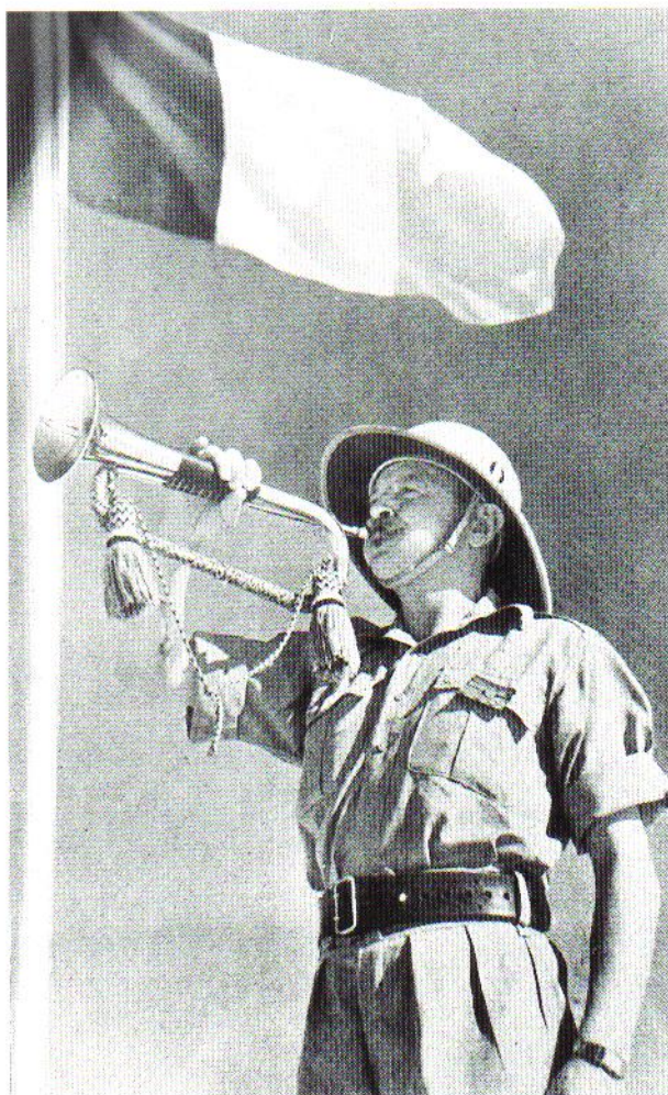
A bugler corporal of the 1st French Marine Infantry Battalion in Palestine, 1941. Note the unit helmet-flash; corporal's two rank bars surmounting bugler's braid on the pocket; and unofficial 'Sam Browne' belt.

On 25 May 1941 the brigade-strength 1st Free French Light Division was formed at Quastina, near Tel Aviv, under Maj. Gen. Legentilhomme. The 5,400 men—2,000 French, 3,400 légionnaires, Africans and Arabs—formed 1st Brigade (BM1 & 2, 1 er BLE), 2nd Brigade (BM3 & 4, 1 er BIM); 1 er BFM, 1st Tank Co., 1/1 er RSM, 1st & 2nd Arty. Btys., and 100 ex-Vichy Circassian cavalry. On 8 June the Division invaded the Levant with other Allied forces, encountering unexpectedly fierce resistance from Vichy forces, who regarded them as traitors and British stooges, before entering Damascus on the 21st. The campaign ended on 11 July, but only