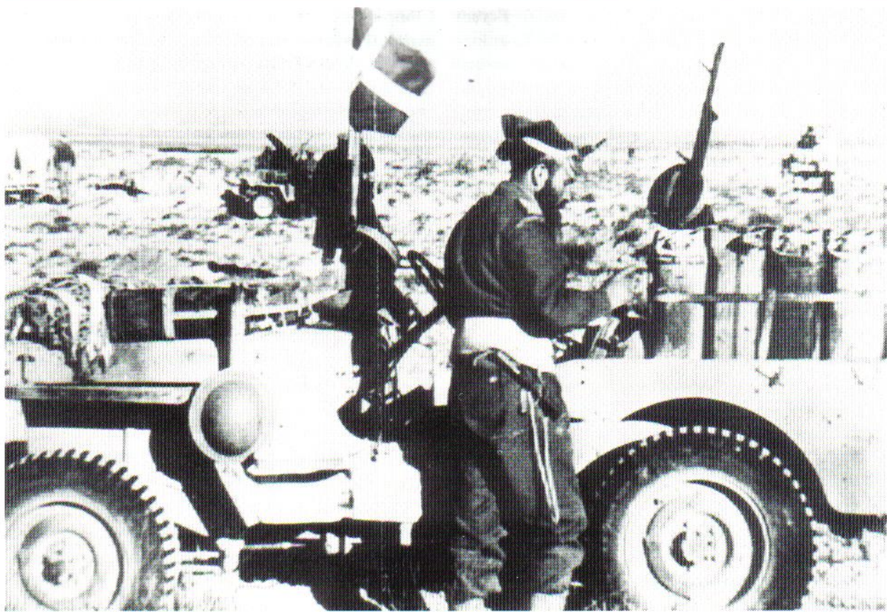
A member of the Greek Sacred Company prepares to go out on patrol in the Libyan desert, 1943.

In mainland Greece the Communist-dominated 'National Liberation Front' (EAM), established September 1941, formed its military wing, the 'National People's Liberation Army' (ELAS) in April 1942. EAM infiltrated agitators into the Greek Forces to stir up dissatisfaction with the king. They engineered riots in Cairo in March 1943 and in Palestine in July amongst the 1st and 2nd Brigades, then part of British 9th Army. Finally, on 4 April 1944, the 1st Brigade mutinied at Almiriya, only surrendering on 24th when surrounded by British troops. The brigade was disbanded immediately, reforming on 4 June with 3,500 loyal troops as the 3rd Greek Mountain Brigade ('Mountain' was a courtesy title; all Greek infantry were mountain-trained). The 2nd Brigade and other units were disbanded and interned in camps in Libya, Egypt and Eritrea. In August 3rd Brigade embarked for Italy, joining 1st Canadian Division, with which it breached the Gothic Line and entered Rimini after heavy fighting on 21 November.