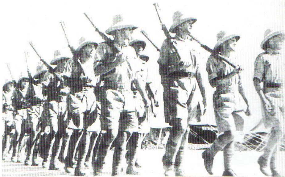
A platoon of the 4th Czechoslovak Infantry Regiment in Palestine in October 1940, wearing British pith helmets and shouldering British SML.E rifles.

dormant, and up to 5,000 Czechs died in a German orgy of revenge—in political prisons, street round-ups, and the destroyed villages of Lidice and Ležáky.