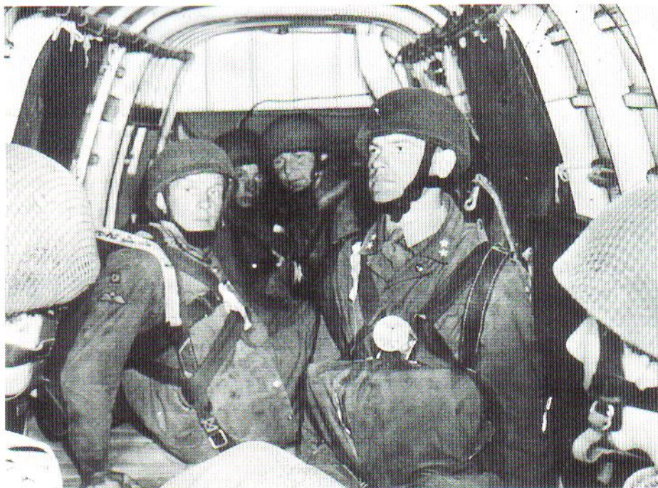
A Norwegian Independent Parachute Company lieutenant (centre right) and troops wearing the grey-green cotton duck smock. Note the Norwegian flag and British parachute wings worn by the private (centre left); 1943.

refugees and VIPs. By May 1945 Kompani Linge, 245 strong, had joined the Norwegian Brigade.