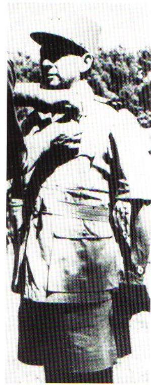
A Free French brigadier-general wearing a khaki kepi and British khaki-drill bushjacket and shorts, being decorated by General de Gaulle, 1942.

13th Corps in Egypt, and on 17 January 1942 helped capture Halfaya Pass. Ordered to Gazala, Libya, it diverted south to the desert outpost of Bir Hacheim, and on 27 May its 3,600 men met the full force of Rommel's offensive, withstanding repeated attacks before the 2,700 survivors broke through to British lines on 11 June. In recognition De Gaulle rechristened them 'Fighting French'.