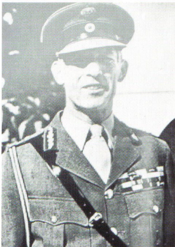
King George II of Greece, wearing pre-war service uniform in Cairo, June 1941.

from Yugoslavia on 7 April 1941. On 1 June the remaining Greek and Allied forces surrendered after a last stand on Crete against German airborne units.