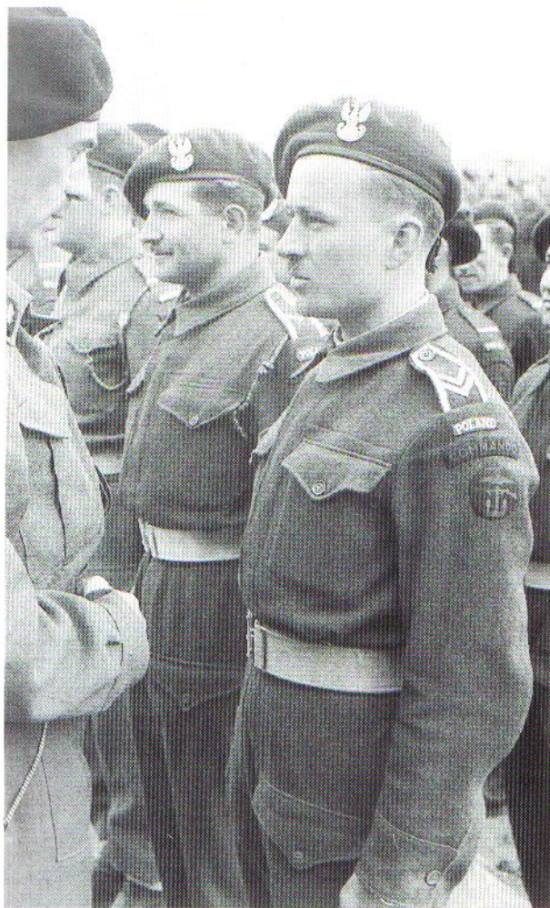
A staff sergeant of the Polish 2nd Motorised Commando Battalion, in green beret and adapted 'No. 10 Commando' shoulder title, being congratulated by Lt. Gen.