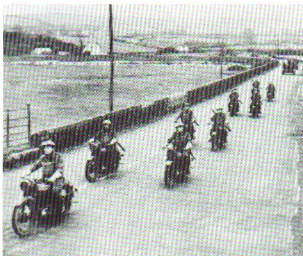
Motorcyclists of the Belgian 1st Fusilier

Units were established on 24 September, and on 11 January 1941 they became the Royal Netherlands Brigade, on 26 August receiving the title 'Prinses Irene' in honour of Wilhelmina's daughter. The