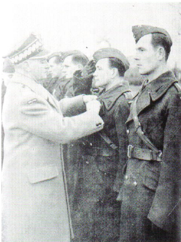
Lt. Gen. Sikorski, tragically killed in a flying accident at Gibraltar on 4 July 1943, decorates two

On 16 April 1944 21 Czechoslovak pilots arrived