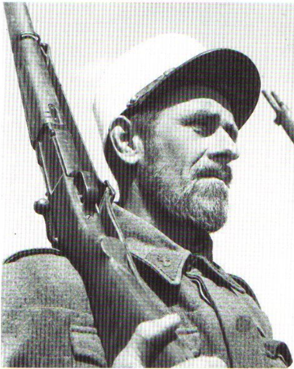
Legionnaire of the 13DBLE at Bir Hacheim, 1942: white-covered kepi; British battledress, with applied dark blue collar patches bearing green grenade. Note that at this date the 13DBLE still had MAS.36 rifles and French leather belts and pouches, but British web anklets.