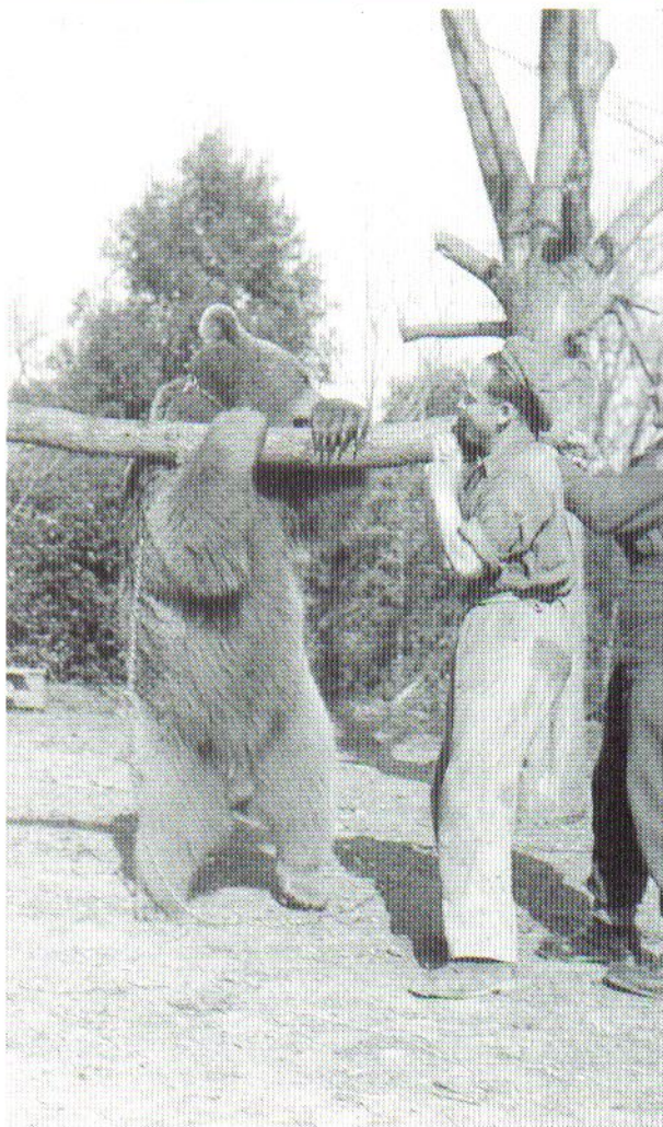
Vojtek, the brown bear, was adopted by Polish 2nd Corps in Iran in 1942 and in Palestine joined 22nd Artillery Supply Company. At the battle of Monte Cassino he carried shells to forward artillery positions. His likeness was subsequently incorporated in the unit badge. He died in Edinburgh Zoo in 1964.

1st Independent Commando Company, formed September 1942, joined 10th (Inter-Allied) Commando on 10 February 1943 as 6 (Polish) Troop. Initially sent to Algeria in September 1943, it fought on the Sangro and Garigliano Rivers, on the Italian Adriatic and Mediterranean coasts respectively, with British 2nd Special Service Brigade. It transferred in April 1944 to 2nd Polish Corps, fighting at Monte Cassino and Ancona; and on 3 August left 10th Commando, joined 2nd Armoured Brigade, and expanded into the 2nd Motorised Commando Battalion, which fought at Bologna.