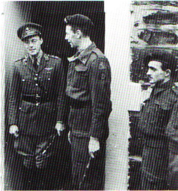
HM Prince Bernhard of the Netherlands, escorted by Capt. Mulders, visits Dutch commandos at Port Madoc, North Wales, 1943. Mulders wears 'No. 10 Commando' title over

national patch and Combined Ops. badge