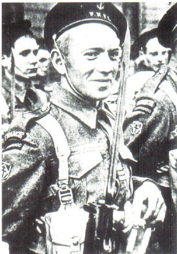
French 1st Marine Commando Company soldiers in 1942 wearing

There were two FAFL airborne units. 1st Air Infantry Company (1 e CIA), formed 15 September 1940, carried out missions into occupied France; and in October 1941 became 1st Parachute Infantry Company (1 e CCP), operating as the 'French SAS Squadron' in Libya, on 16 September 1942 capturing Benghazi. On 1 July 1943 it became 4th Air Infantry Bn. (4 e BIA) in England, and on 7 January 1944 2nd Parachute Infantry Rgt. (2 e RCP), also called 2SAS, joining the new SAS Brigade along