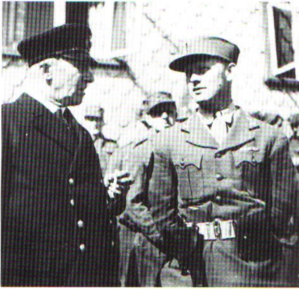
A captain of Norwegian Company Iceland on parade. Note the grey-green M1934 'Finnmark' ski-cap with British service