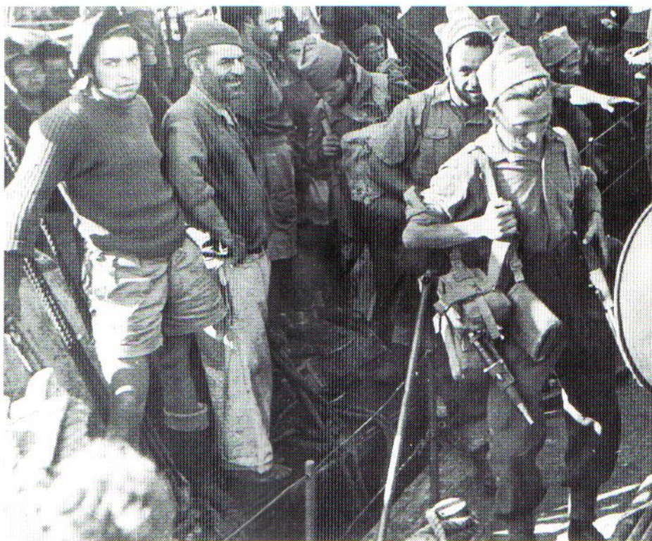
Greek Sacred Company troops disembark from a fishing-boat in the Aegean, 1944. Cap comforters were popular and practical field headgear.