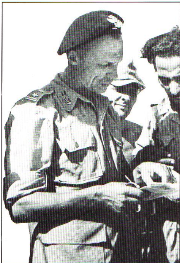
A lieutenant-colonel of the Polish Carpathian Lancers, the reconnaissance regiment of the 2nd Armd. Div., at Pessaro, Italy. He has the silver national badge on his black beret, and—obscured here—the rank insignia of two stars above a double bar; the beret also

bore red regimental piping around the top of the brow band. Ranking is worn in silver metal on the shoulder straps of the KD bush-shirt; and note collar patches—cavalry pennons, in dark blue over crimson, with applied silver regimental badge of palms and crescent.