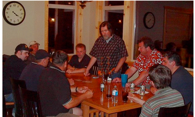
Photo below: Like the 24 Hours of Le Mans, the GASP goes all day, and sometimes, all night. These dedicated golfers are not prepared to give up their tee off time to gamble, at least not when you can give up sleep instead!

Cartoon: Lyle and his computer at RONA just before the GASP (or anytime, when you think about it).