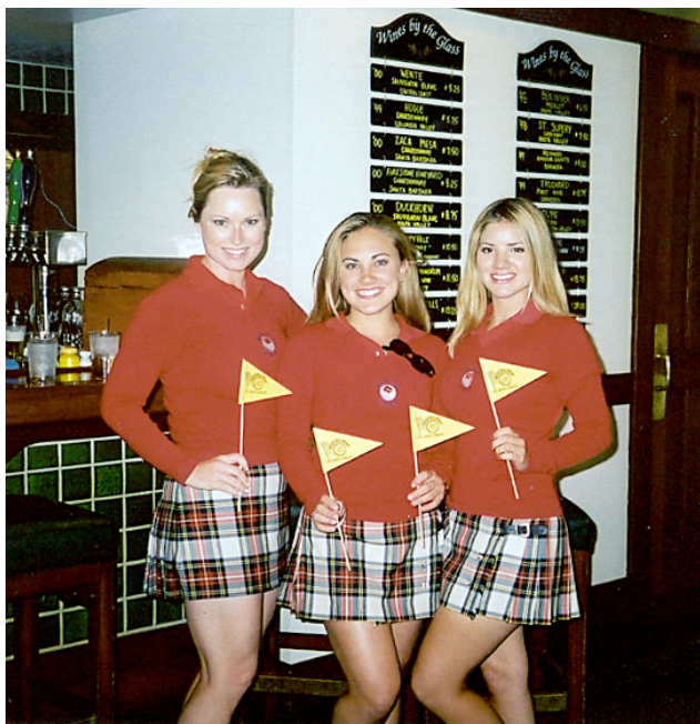
Photo below: Kananaskis is providing a new set of proximity markers in 2008. Sadly, the markers can't be placed on the surface of the greens, so these caddies are provided to mark the spot for us.