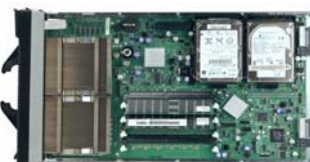
IBM HS20 2-wav Blade

http://www-1.ibm.com/servers/eserver/bladecenter/