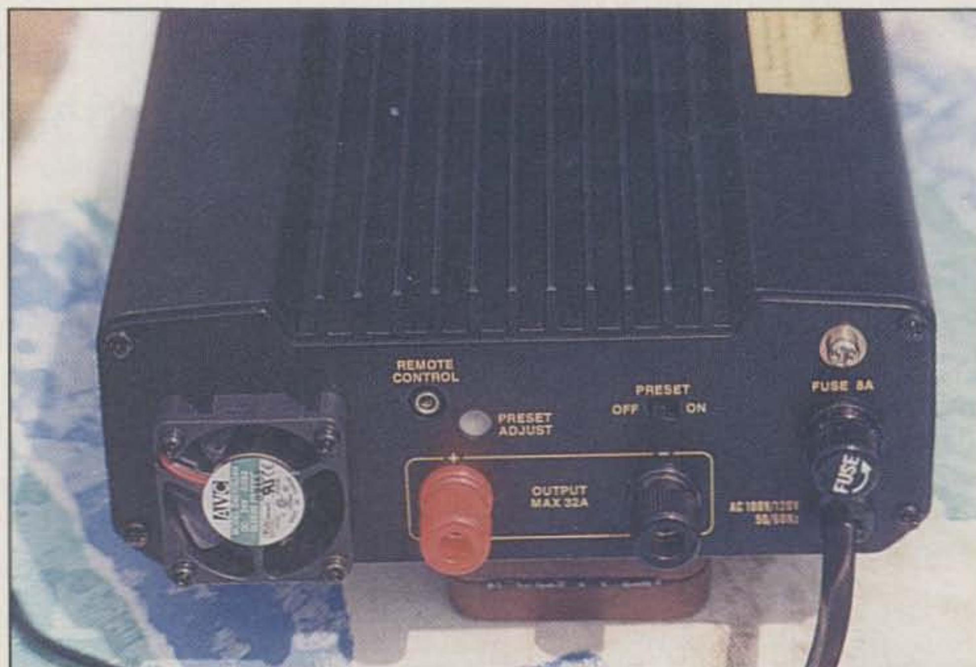
The rear of the unit contains the over-temperature fan on the left and a set of 32 amp maximum rating terminal posts. The rear panel has a jack for remote-control input along with the preset function. The unit uses an 8 amp fuse.

I wish to express my thanks to Evelyn Garrison, WS7A, and Katsumi Nakata, KE6RD, of Alinco for their help in getting me technical information on the power supply. ■