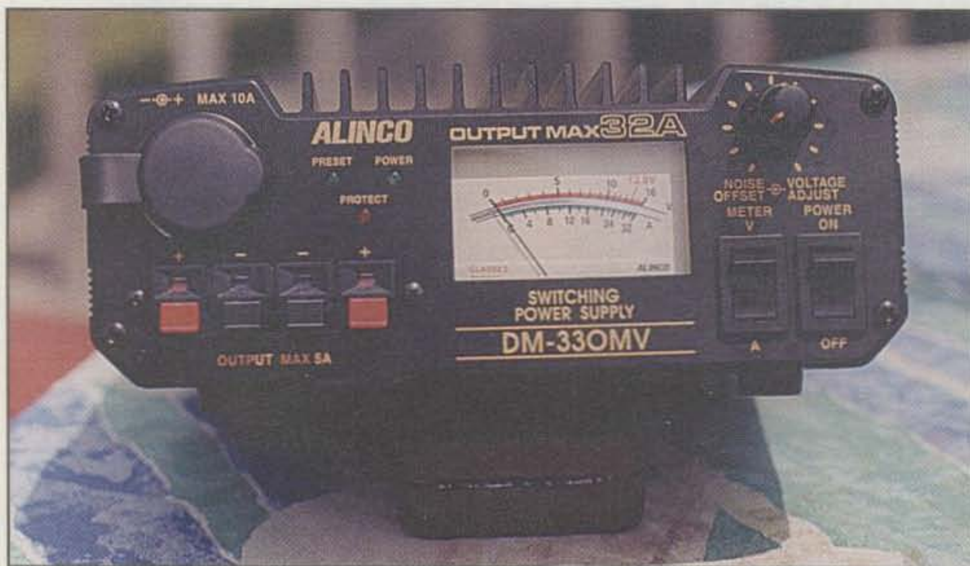
Front view of the DM-330MV shows the various switches and the dual-function meter. The switching for the meter between current and voltage is on the immediate right of the meter.

for electronic aircraft equipment. I was amazed by the number of major reliability problems associated with the conventional non-switching designs that were solved by a lighter design with fewer components. Typically, the larger power-supply components in electronic equipment were the first components likely to break while operating in the high-vibration aircraft environment. The newer switching-mode power-supply design used in many commercial applications is now making its way into amateur radio.