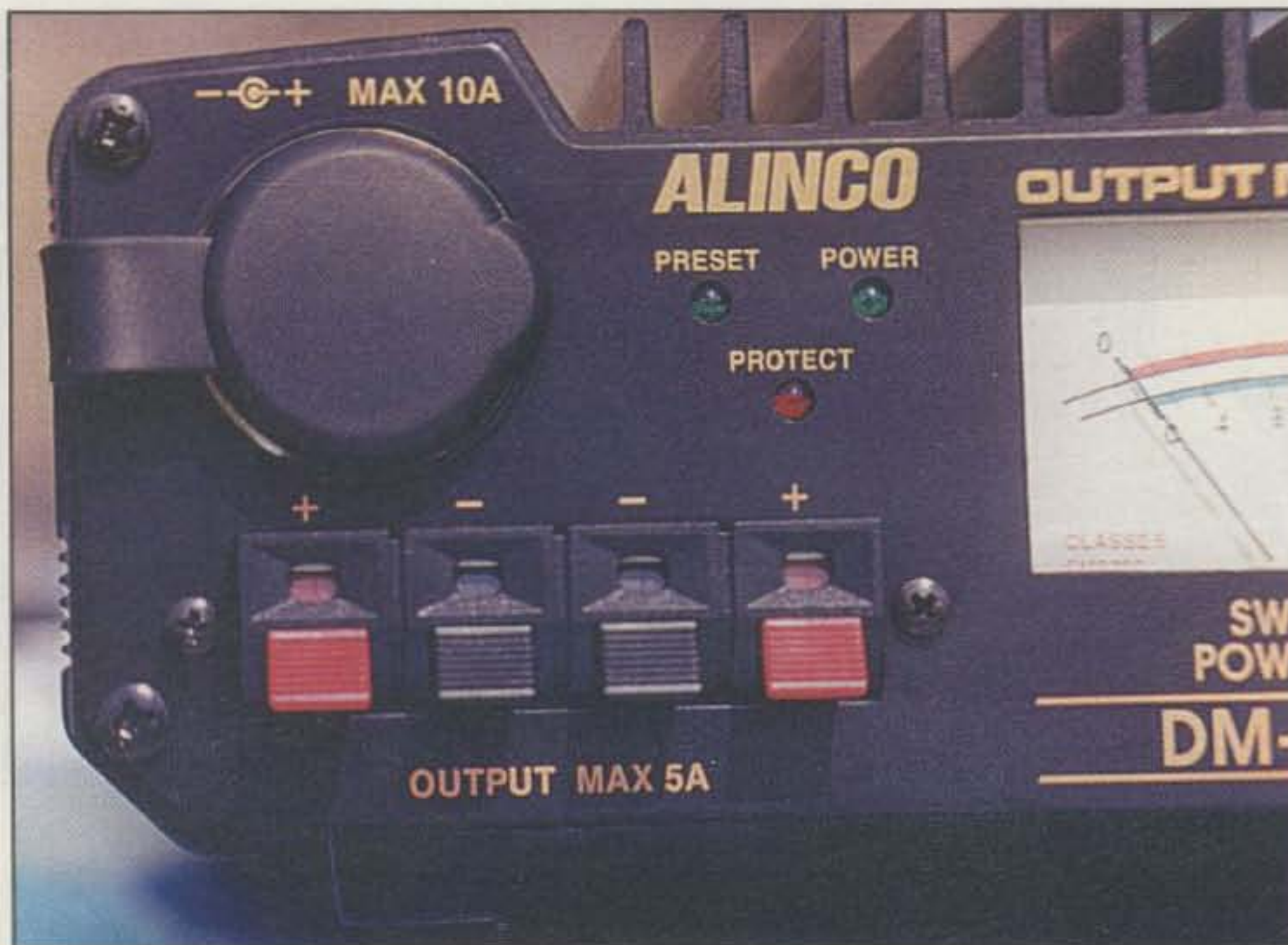
In this close-up view of the front panel, the three LED indicators for PRESET, POWER, and PROTECT can be seen to the left of the meter. The cover on the left is over the cigarette-lighter-type jack input (10 amp max), and the inputs on the bottom are set at 5 amps max.

This allows you to connect a remote-control unit (with the power supply turned off) and remotely control the output voltage.