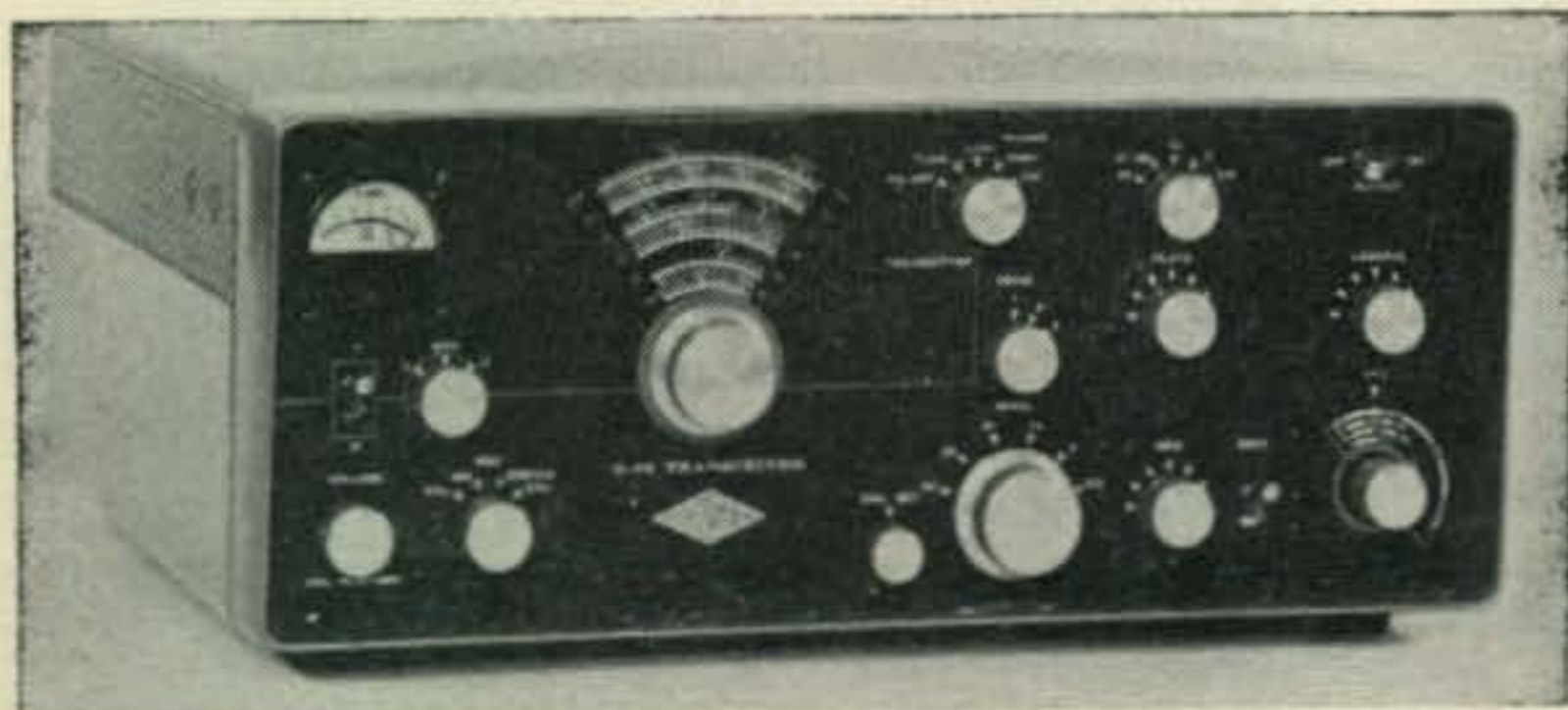
Front view of the G-76. Controls from l. to r., along the bottom edge: dual purpose r.f.-a.f. gain, function switch, calibration reset, rcvr. band switch, grid tuning, v.f.o. spot switch, 80-10 m v.f.o. In the second row from l. to r.: T-R switch, b.f.o. set, main tuning, drive switch, plate tuning and loading. The transmitter function switch, final bandswitch and main on-off switch are at the upper right.

The antenna input, common to both receiver and transmitter, is designed for 50 ohm unbalanced (coax) line. The antenna change-over relay is included in the G-76 circuitry, and is automatically operated by the front panel TRANSMIT switch.