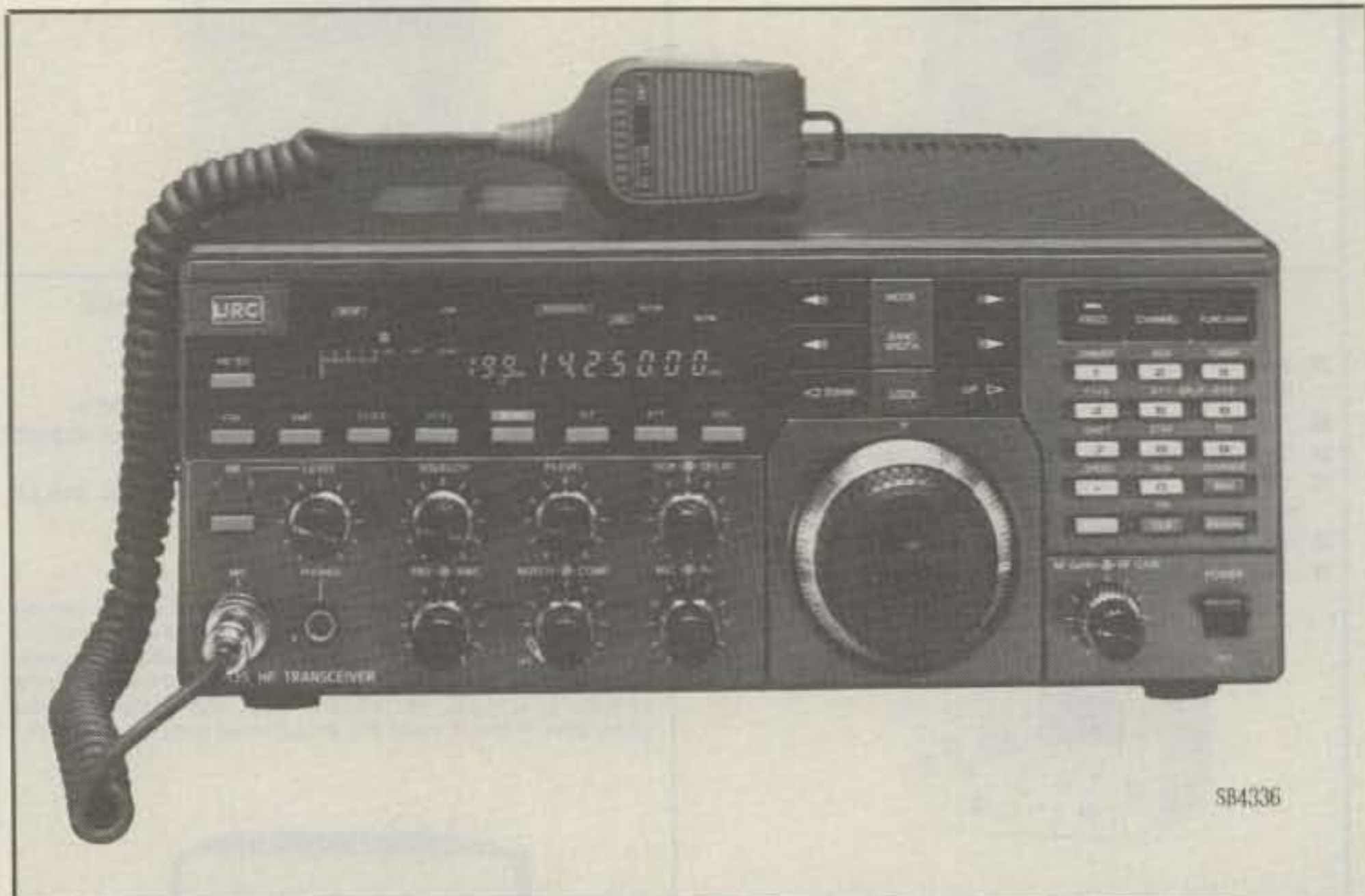
The JST-135HP transceiver from Japan Radio Corp.

The transmitter uses a low-distortion power amplifier which features a large combiner transformer. Its Class A driver stage uses the same transistor as the final stage in order to reduce any third-