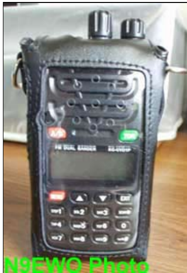
The Wouxun SC-23 Case. Full protection of the front panel keys Just remember to insert the radio from the top. You must remove the antenna every time.