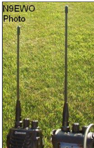
Slightly Shorter Antenna In Later Versions Later in production, the included antenna became slightly shorter. Older version on the right in the above picture (sorry , we were unable to test performance between the two)