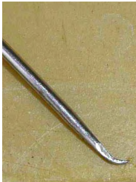
Fig. 4: Levering out small relays with a bent screwdriver.

When I later progressed to repairing tape recorders, radios and Hi-Fi equipment, smokers once again helped pay my wage. I would frequently get equipment brought to me from pubs, would squirt cleaning fluid on the PCBs and watch a yellow stream flow off. Fortunately, equipment seemed to have been specially designed so that the ingress of nicotine did not do its worst until the guarantee had run out! Switches then became intermittent, variable