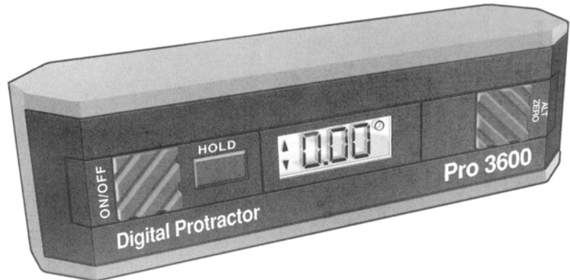
Pro 3600 Digital Protractor

The Pro 3600 Digital Protractor is a revolutionary measuring tool that provides an immediate, digital reading of all angles in a 360° circle. The machined aluminum frame is a rigid, lightweight, ultra-precise platform that allows the state-of-the-art sensor and its microprocessor circuit to provide unsurpassed accuracy throughout the Protractor's 360° range.